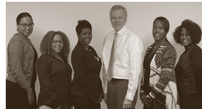
The Trust Fund Staff

Representatives from advocacy organizations and services providers across the state as well as individuals with traumatic brain injury and spinal cord injuries and their family members serve as members of three strategic committees and multiple work groups. These dedicated members work tirelessly throughout the year to plan and assess the statewide service structure and recommend changes to ensure care needs are being met and supports are available to promote community integration and independence for all individuals.